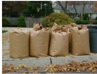
Photo of leaf, yard and tree trimming waste bagged at curbside for collection

stores and hardware/home improvement stores