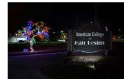
Second Place in Business Category American College of Hair Design