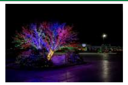
First Place in Business Category Inter-State Studio, Inc.

Winners of the 2017 City of Sedalia Christmas Light Contest were recognized in both the residential and business categories at the January 2, 2018 City Council meeting. Thank you to all our participants.